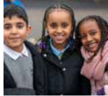
Mixed Age Classes with Early Years