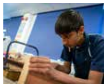
DT Subject Leader Specialist Groups