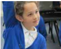
Primary History Subject Leader Specialist Groups

Click on your chosen programme below to book