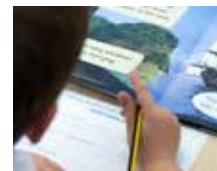
Primary English Subject Leader Development Forum