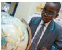
Primary Geography Subject Leader Development Groups