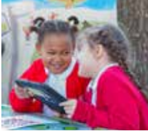
Early Years Development Groups

Click on your chosen programme below to book