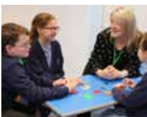
SEND Specialist Groups