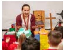
Primary RE Subject Leader Development Programme