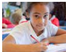
Primary MFL Subject Leader Development Groups