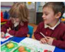
Primary Art Subject Leadership Groups