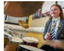
Music Subject Leader Specialist Groups