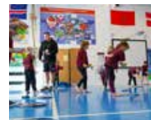
Primary PE Subject Leader Specialist Groups