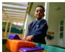
SEND In The Mainstream