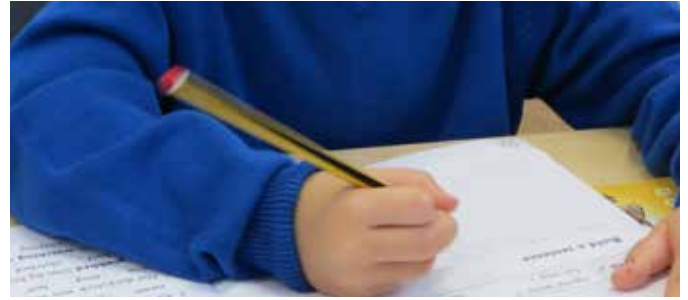
Developing the Expertise in Writing (Primary and Secondary Colleagues) Monday 6th February