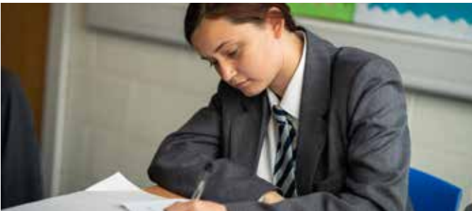
Assessing Pupil Progress in RE Tuesday 7th February