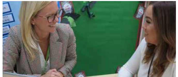
Leading Effective Meetings Monday 27th February