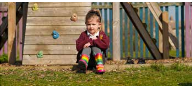
Domestic Abuse and Parental conflict Friday 3rd March