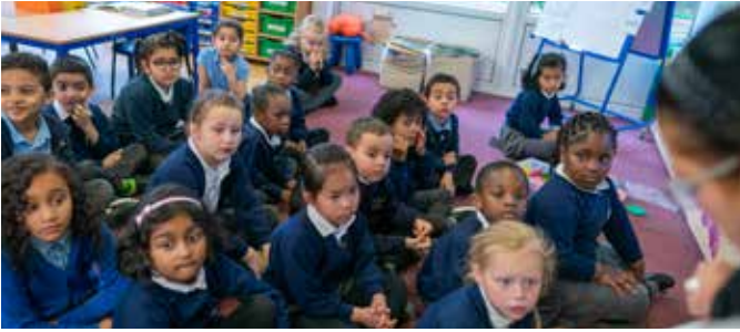
Developing Early Years with Mixed Aged Classes: Thursday 2nd February