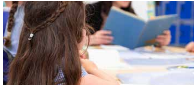
Primary History Conference Thursday 2nd March