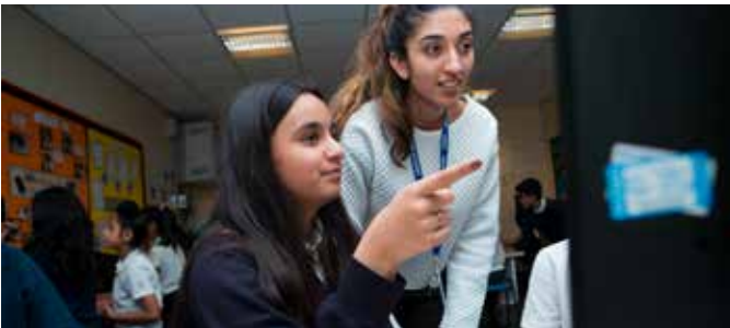
Early Years TA Training Wednesday 1st March