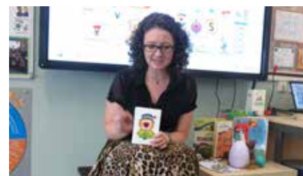
Active English Open Morning Tuesday 28th November