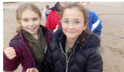
Teaching about child-on-child abuse & sexual harassment - Primary Tuesday 21st November