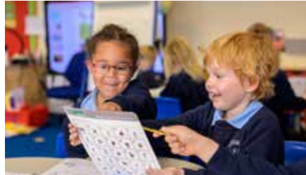
Disciplinary Literacy Thursday 30th November

Substantive Knowledge and the Disciplines FREE