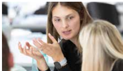
Post ECF Programme- How to implement subject knowledge expertise Monday 20th November