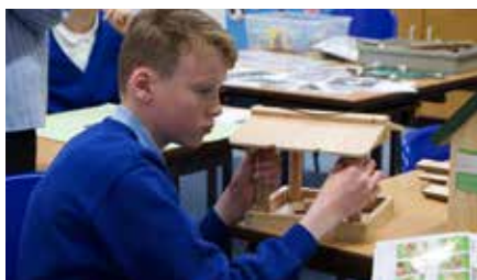
Primary DT Subject Leader Specialist Group Monday 6th November