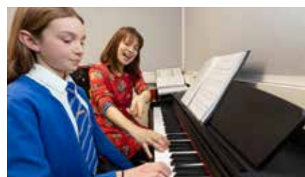
Creating your Music Development Plan Thursday 9th November