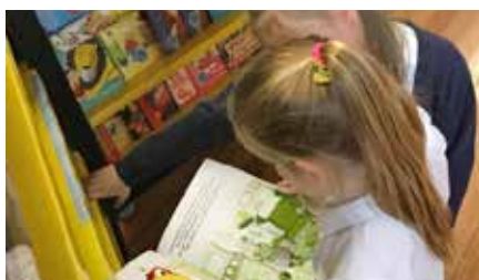
Early Years Subject Leader Specialist Group Wednesday 8th November