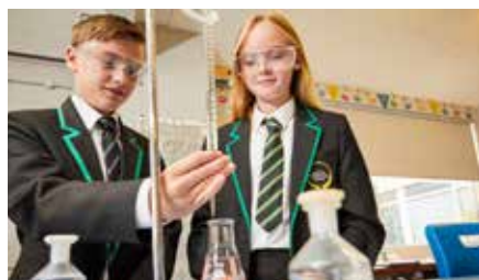
Teaching about child-on-child abuse & sexual harassment - Secondary Tuesday 14th November