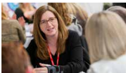
Effective Governance Tuesday 7th November