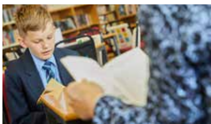
Secondary English Subject Leader Specialist Group Monday 6th November