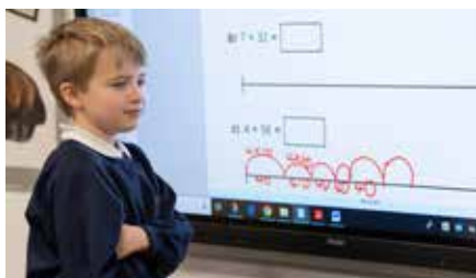
Primary Math Subject Leader Specialist Group - Bourne Monday 13th November