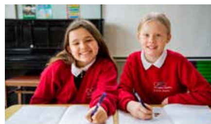
A Learner First Approach Monday 6th November