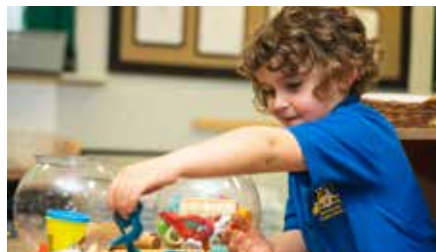
How inclusive is your classroom? Monday 20th November