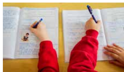
Y1- Developing the expertise of teachers in the teaching of writing Wednesday 8th November