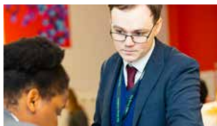
Secondary Math Subject Leader Specialist Group Monday 27th November