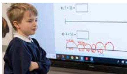
Primary Math Subject Leader Specialist Group- Lincoln Tuesday 21st November