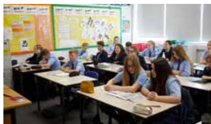
Secondary Languages Subject Leader Specialist Group Thursday 16th November