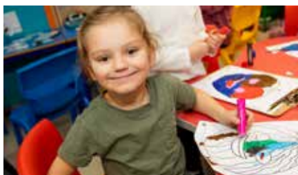
Primary Art Subject Leader Specialist Group Monday 13th November