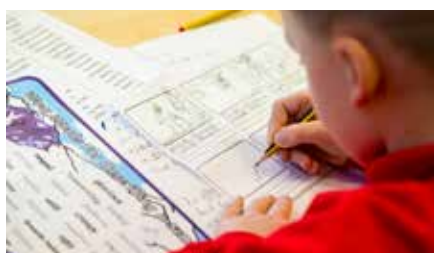
Y2 ONLY - Developing the expertise of teachers in the teaching of writing Wednesday 8th November