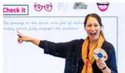
Active Spelling Open Morning Monday 20th November