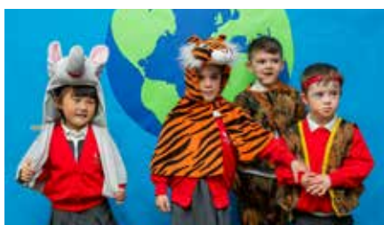
Primary Languages Subject Leader Specialist Group Thursday 9th November