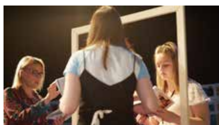
Pupil Articulation Tuesday 28th November